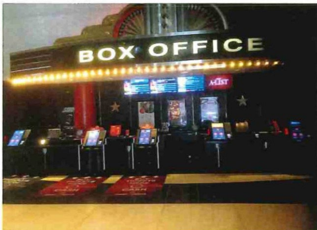
Stage & Screen Quarterly June 2024